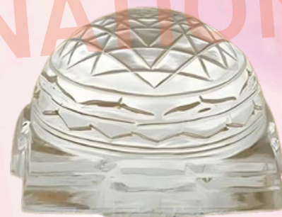
CRYSTAL DOM SHAOED 3.5X3.5 INCHES