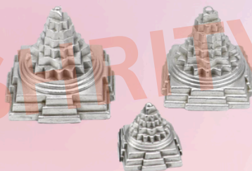
PARAD SHRI YANTRA 2 CM / 3.2 CM / 3.8 CM