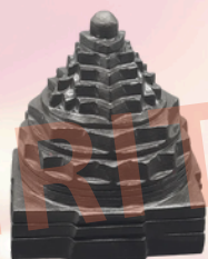
SHALIGRAM SHRI YANTRA 2 INCHES