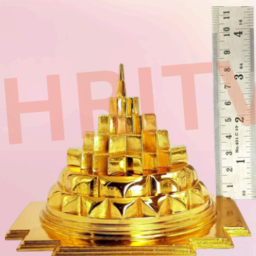
BRASS AND PANCHDHATU 3X3 INCHES