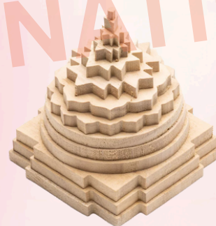
SHRIPARNI SHRI YANTRA 3 INCHES