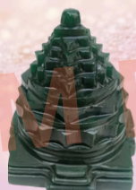
GREEN AVENTURINE SHRI YANTRA 3 INCHES