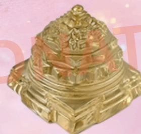
YELLOW CITRINE SHRI YANTRA 3 INCHES