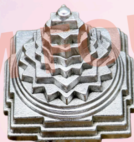
PARAD SHRI YANTRA 3 INCHES